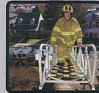
Highest, widest and safest handrails

GSO 8531 TULLYTOWN FIRE CO. BUCKS COUNTY, PA