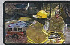
Easy Rescue with Stokes