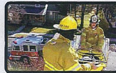
Easy Rescue with Stokes